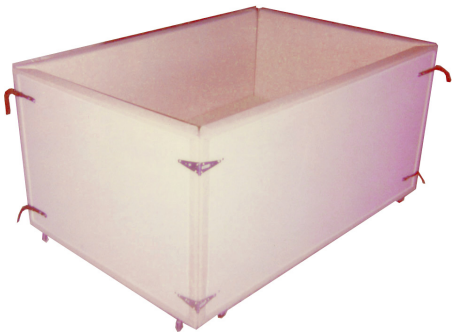
CraigBed - Closed and Latched