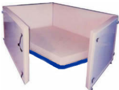
CraigBed with 4' Riser Block