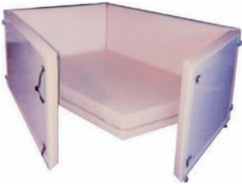
Craig Bed shown with optional foam riser block under mattress